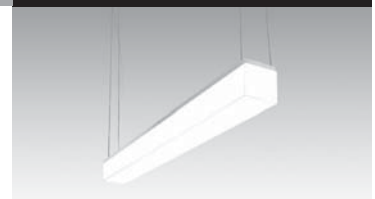
Pendant Linear Kubo