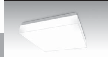
24" Surface Kubo