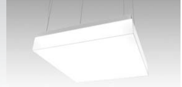
24" Pendant Kubo