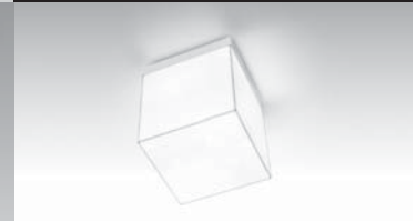
Surface Kubo Single